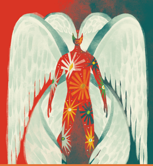
What Isaiah Saw