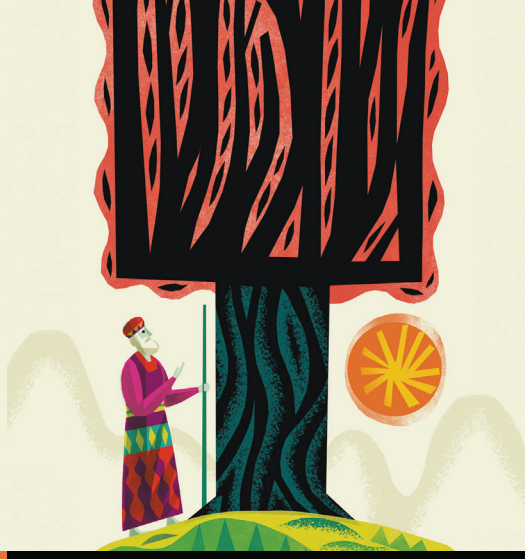
story 13: Exodus 1-3 God Raises Up a Deliverer