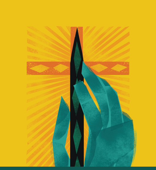
STORY 97: ROMANS 8 No Nothing