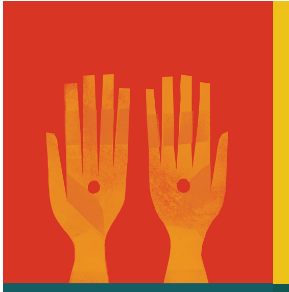
story 98: 1 corinthians 13 Love Is