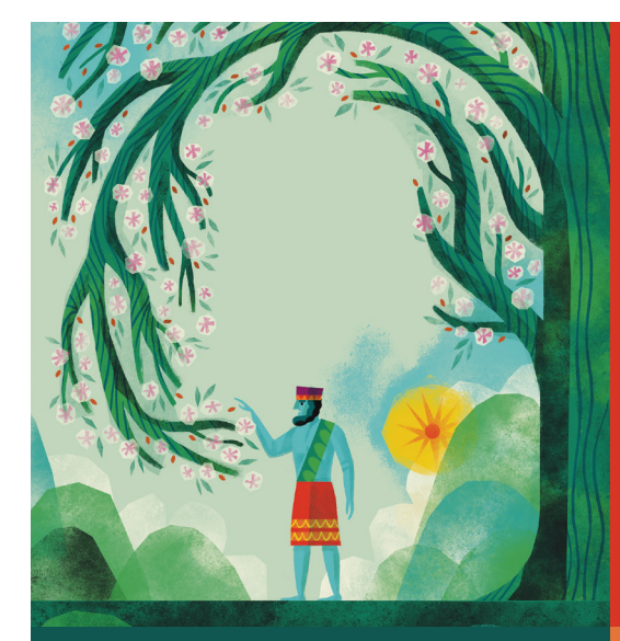
story 42: JEREMIAH 1 Jeremiah against Everyone