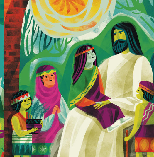
story 71: MARK 10 The Kids Can Come Too