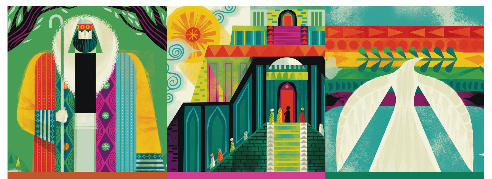
Joseph's Mean Brothers and What God Meant to Do