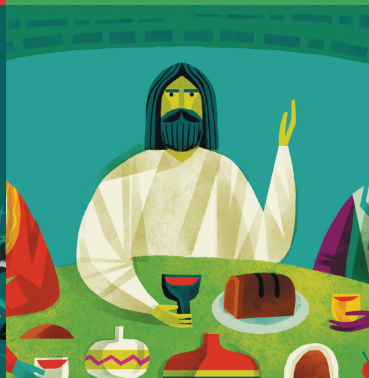
A Meal for the Ages