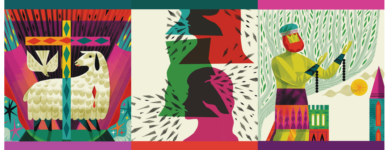
The Center of the Universe