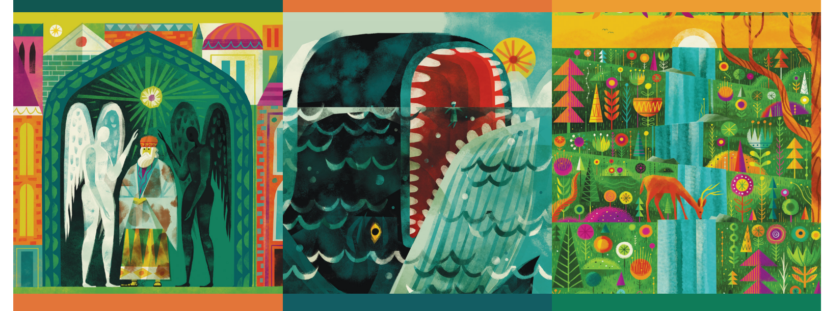
STORY 51: ZECHARIAH 3 A Change of Clothes