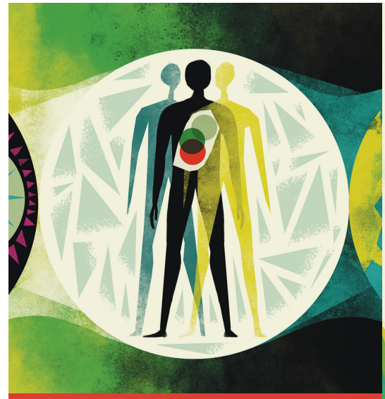
story 69: matthew 16 Confessing Christ