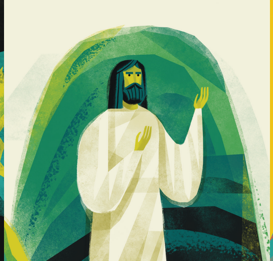
The Sermon That Was