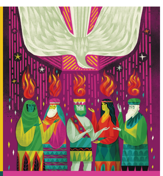
The Spirit Comes