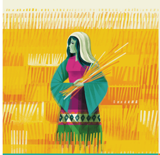
story 24: ruth 1-4 The Girl Who Wouldn't Go Away