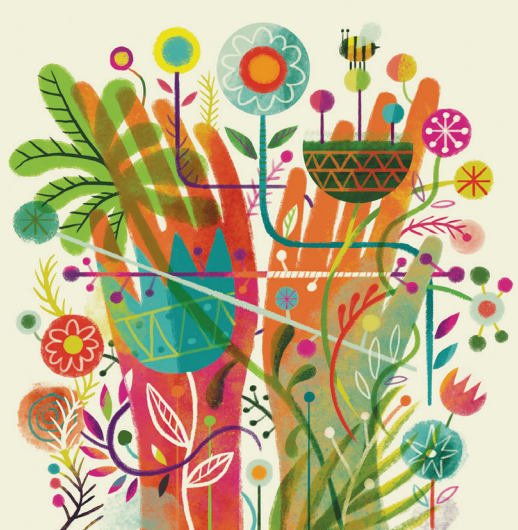
Free at Last